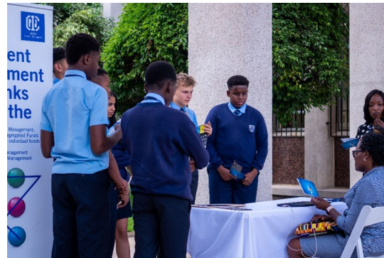
St Andrews International High School learners interacting with an official from NICO Asset Managers during Global Money Week Open Day