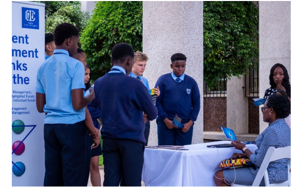
St Andrews International High School learners interacting with an official from NICO Asset Managers