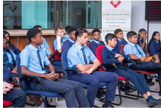
Cross-section of St Andrews International High School learners during their visit at the MSE Global Money Week 2024

The success of Global Money Week 2024 underscores the MSE's dedication to promoting financial literacy and empowerment. Through engagement with young learners and the dissemination of valuable knowledge and skills, we are laying the groundwork for a financially savvy and prosperous future generation.