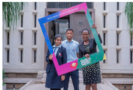
Global Money Week 2024 with Hilltop Learners at MSE