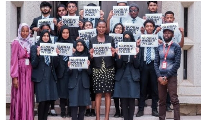
Hilltop Academy Learners during their visit at MSE Global Money Week 2024