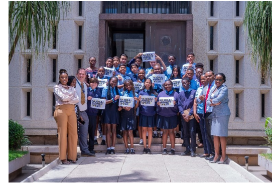
St Andrews International High School Learners during their visit at MSE Global Money Week 2024